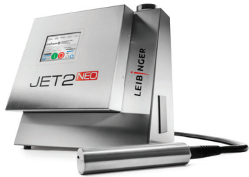
Top choice for standard applications