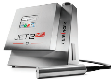
High performer in dusty environments